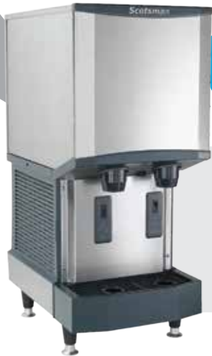
HID312A-1 with optional KLP24A legs